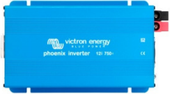
Phoenix Inverter 12/750