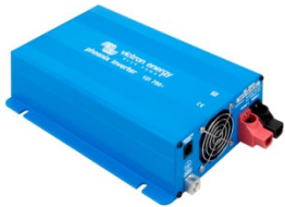
Phoenix Inverter 12/750

For our lower power models we recommend the use of our Filax Automatic Transfer Switch. The Filax features a very short switchover time (less than 20 milliseconds) so that computers and other electronic equipment will continue to operate without disruption.