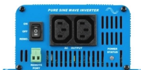
Phoenix Inverter 12/350 with IEC-320 sockets