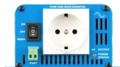
Phoenix Inverter 12/180 with Schuko socket